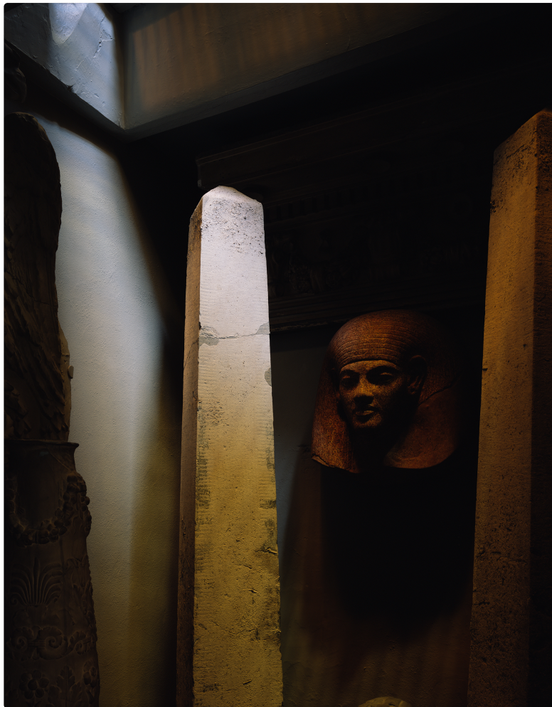
Hélène Binet 'Soane's Light 02' (Architecture by Sir John Soane)