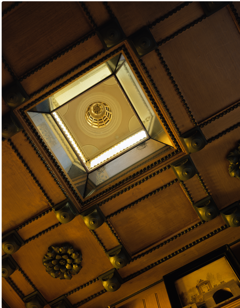
Hélène Binet 'Soane's Light 01' (Architecture by Sir John Soane)